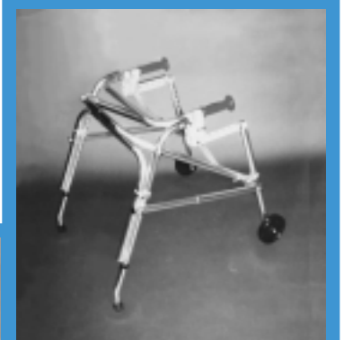
Pediatric Posterior Walker Sensor

The MCW walker sensors incorporate strain gages mounted on strain elements to measure forces and moments. As with most conventional strain gage transducers, bridge excitation and signal amplification are required. AMTI's SGA or MCA amplifiers are high gain devices which provide excitation and amplification for multiple channels in one convenient package. The rack mountable MCA-6, or the desktop SGA6-4 provide the six channels of amplification required by the sensor. These amplifiers process the sensor's low-level signals and provide outputs suitable for an A/D converter so that the data can be stored and processed by a computer.