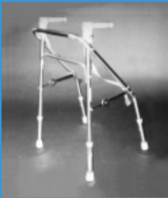
Pediatric Anterior Walker Sensor