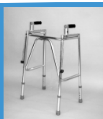
Adult Anterior Walker Sensor